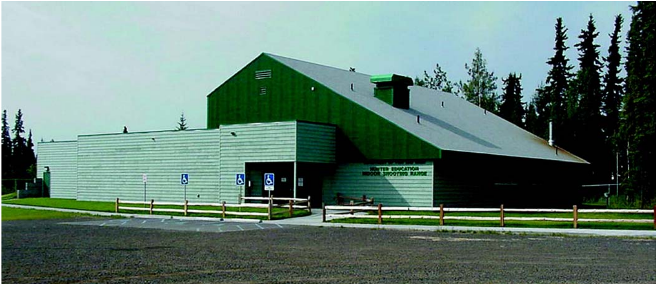
The Hunter Education Indoor Shooting Range in Fairbanks, Alaska, has an outdoor design temperature of -55^{\circ}\text{F} ( -48^{\circ}\text{C} ).

The following article was published in ASHRAE Journal, December 2002. © Copyright 2002 American Society of Heating, Refrigerating and Air-Conditioning Engineers, Inc. It is presented for educational purposes only. This article may not be copied and/or distributed electronically or in paper form without permission of ASHRAE.