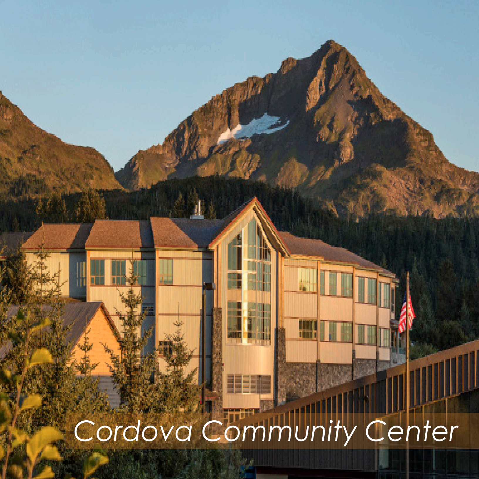
Cordova Community Center