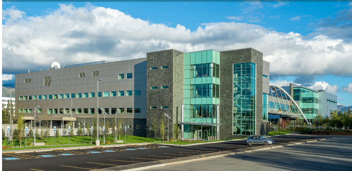
UAA Wells Fargo Sports Complex