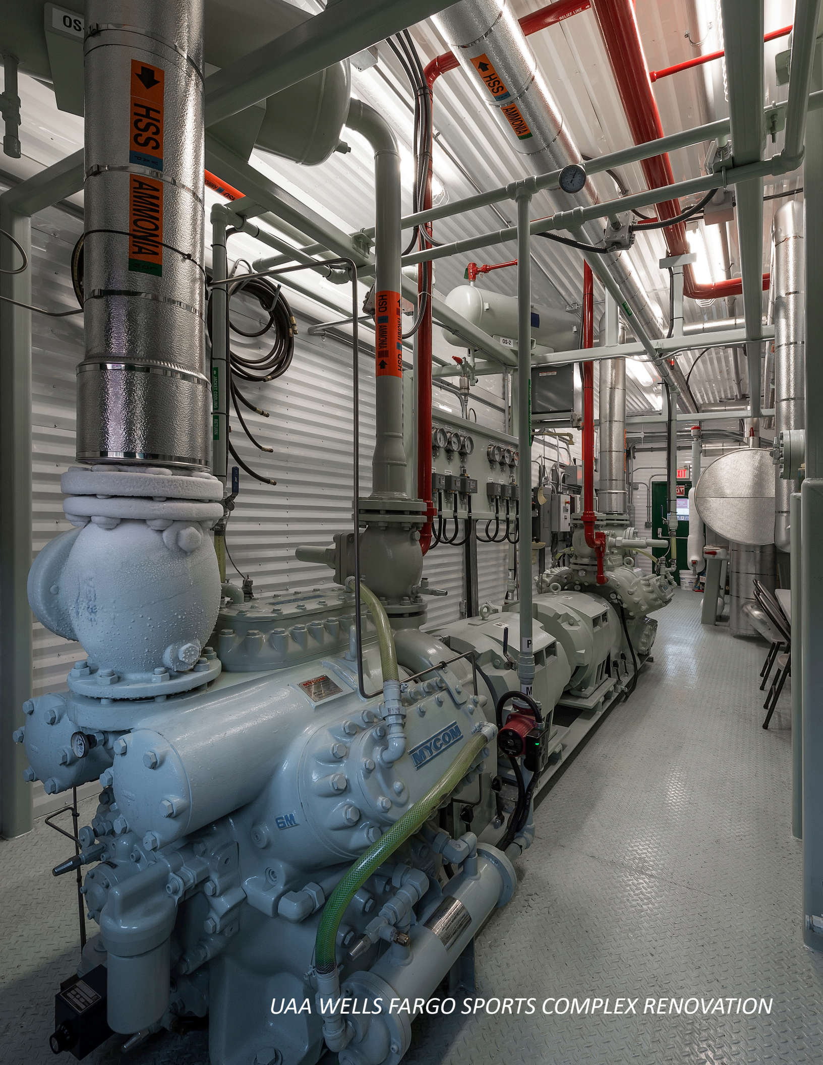
UAA WELLS FARGO SPORTS COMPLEX RENOVATION